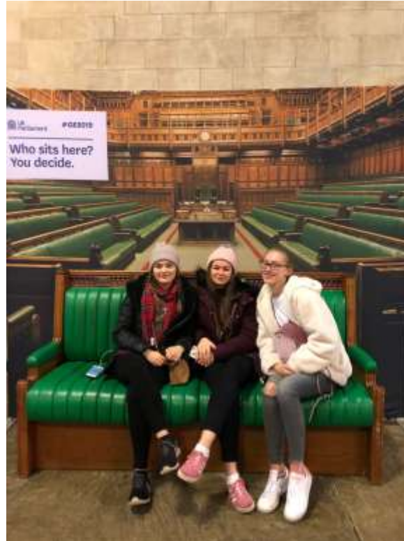
Houses of Parliament