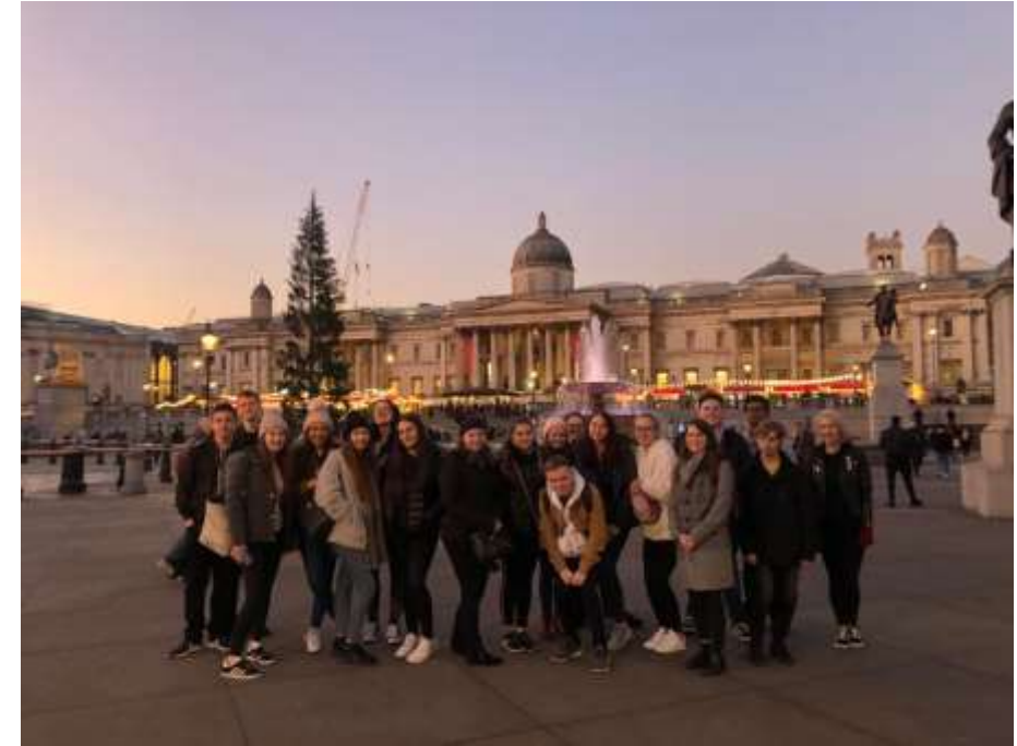
National Portrait Gallery and Christmas markets