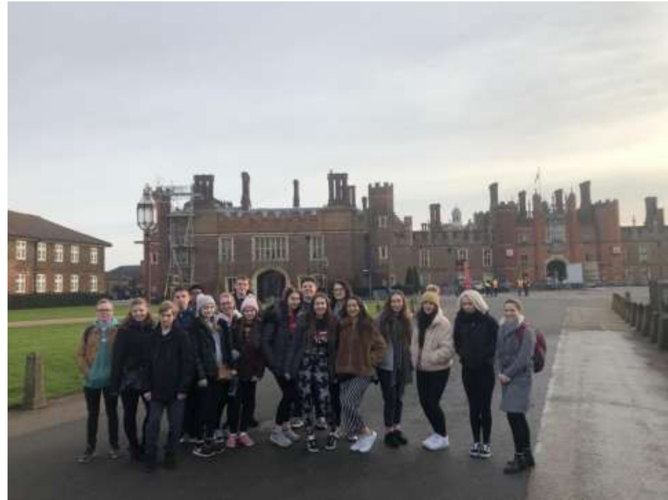
Hampton Court Palace