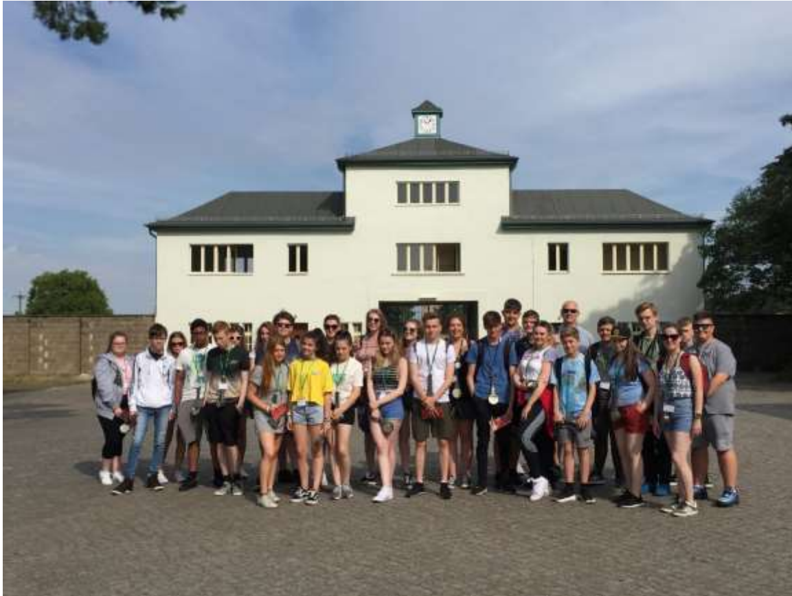
Sachsenhausen Concentration Camp

Y10 and Y12 History Trip to Berlin, 2018