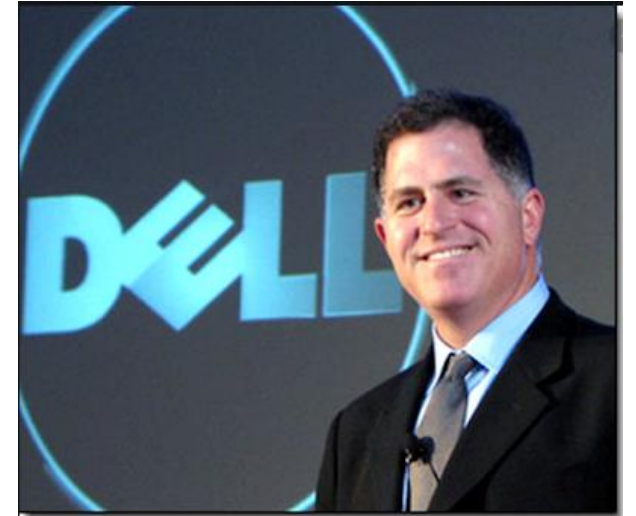
Michael Dell , American Billionaire, founder of Dell Technology

“You don’t have to be a genius or a visionary or even a college graduate to be successful. You just need a framework and a dream”