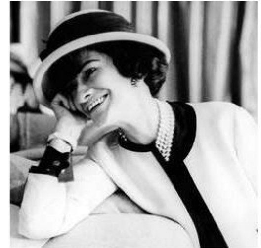
Coco Chanel , French fashion Designer and entrepreneur.

“ Don't be like the rest of them darling”