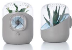
Environment balancing fan