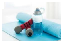
Cutting edge exercise equipment